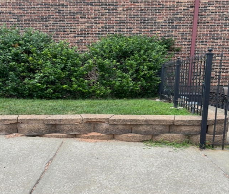
The choice of location for the Brick Program. Let us know which you would like to see. Up front at the flags or down back next to the outdoor patio.