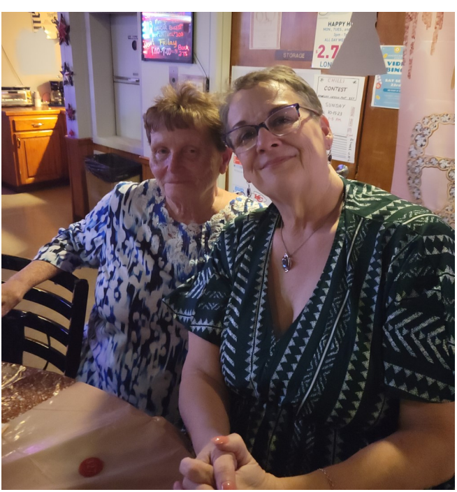
Two of the GREATEST fund raising ladies in any Post