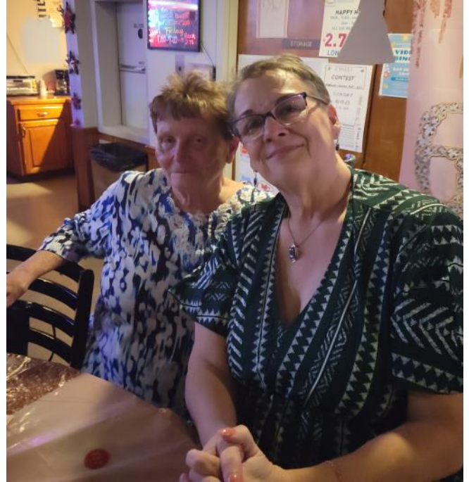
Two of the GREATEST fund raising ladies in any Post